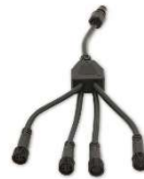
Y-Kabel (4x outlet)